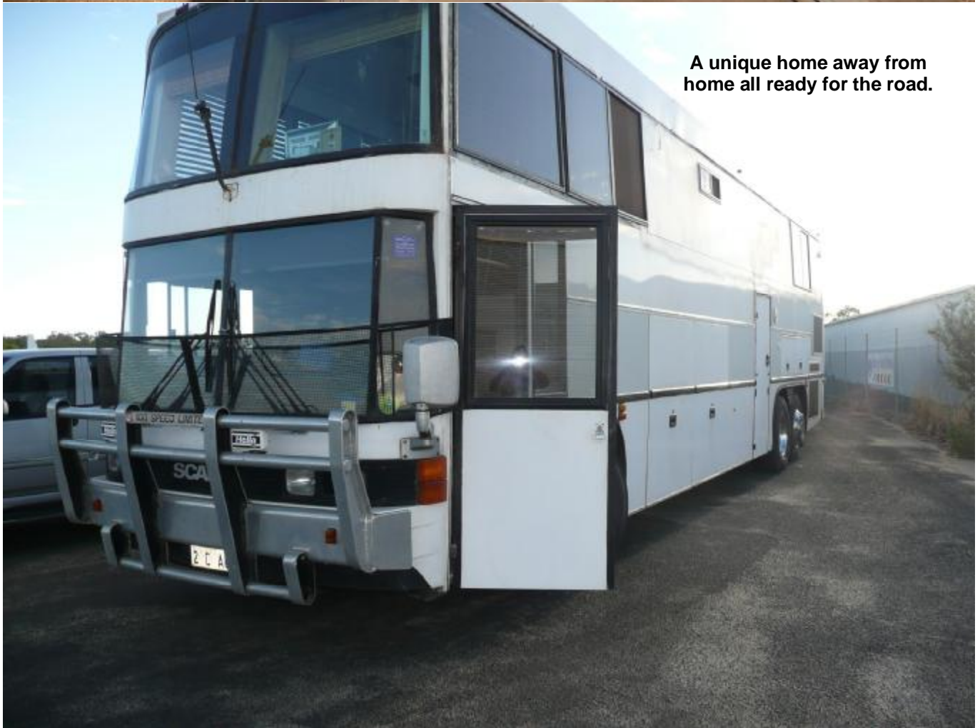
A unique home away from home all ready for the road.