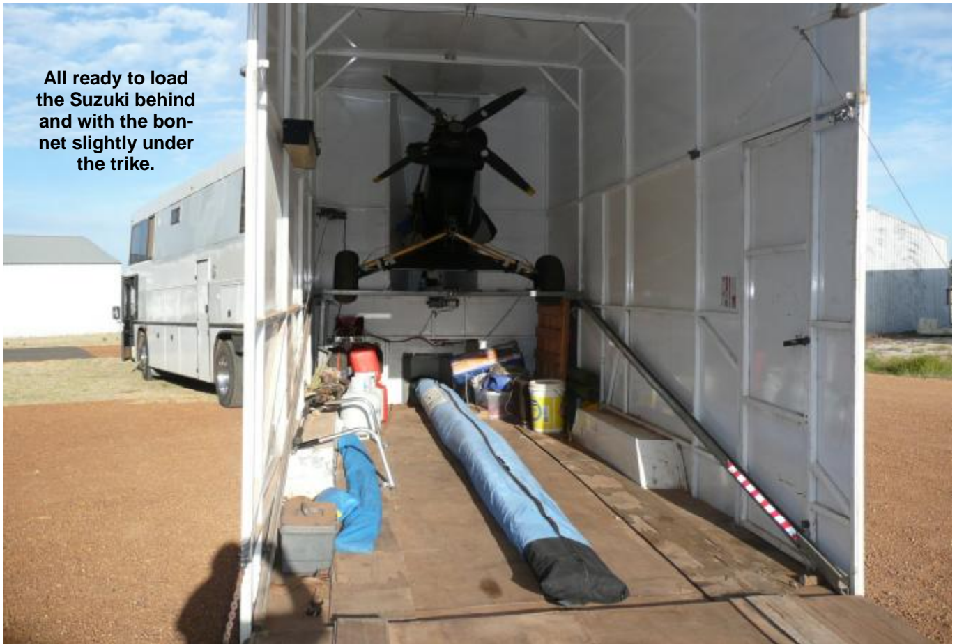
All ready to load the Suzuki behind and with the bonnet slightly under the trike.