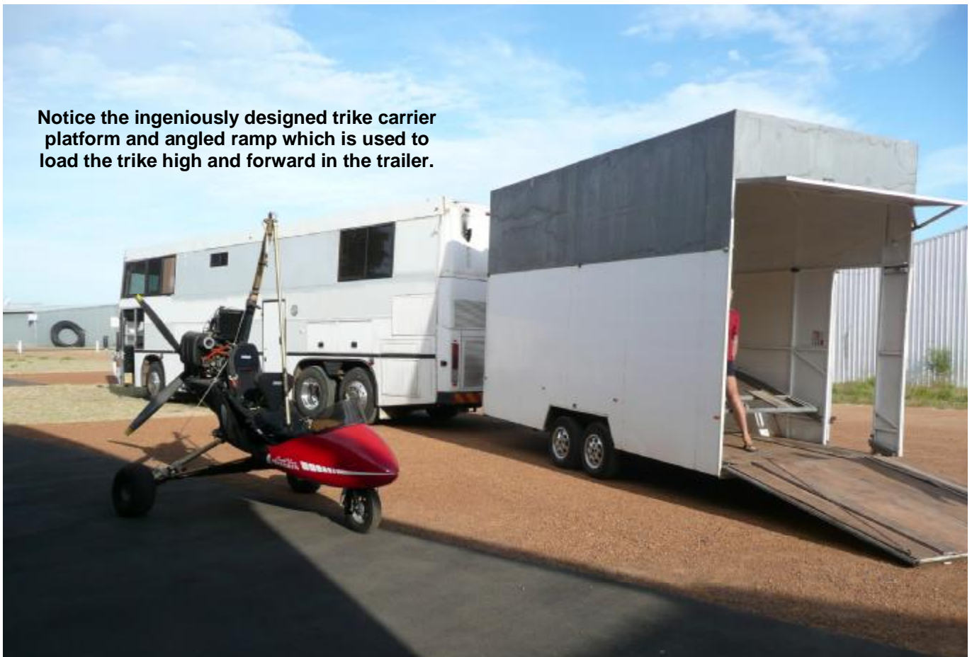
Notice the ingeniously designed trike carrier platform and angled ramp which is used to load the trike high and forward in the trailer.