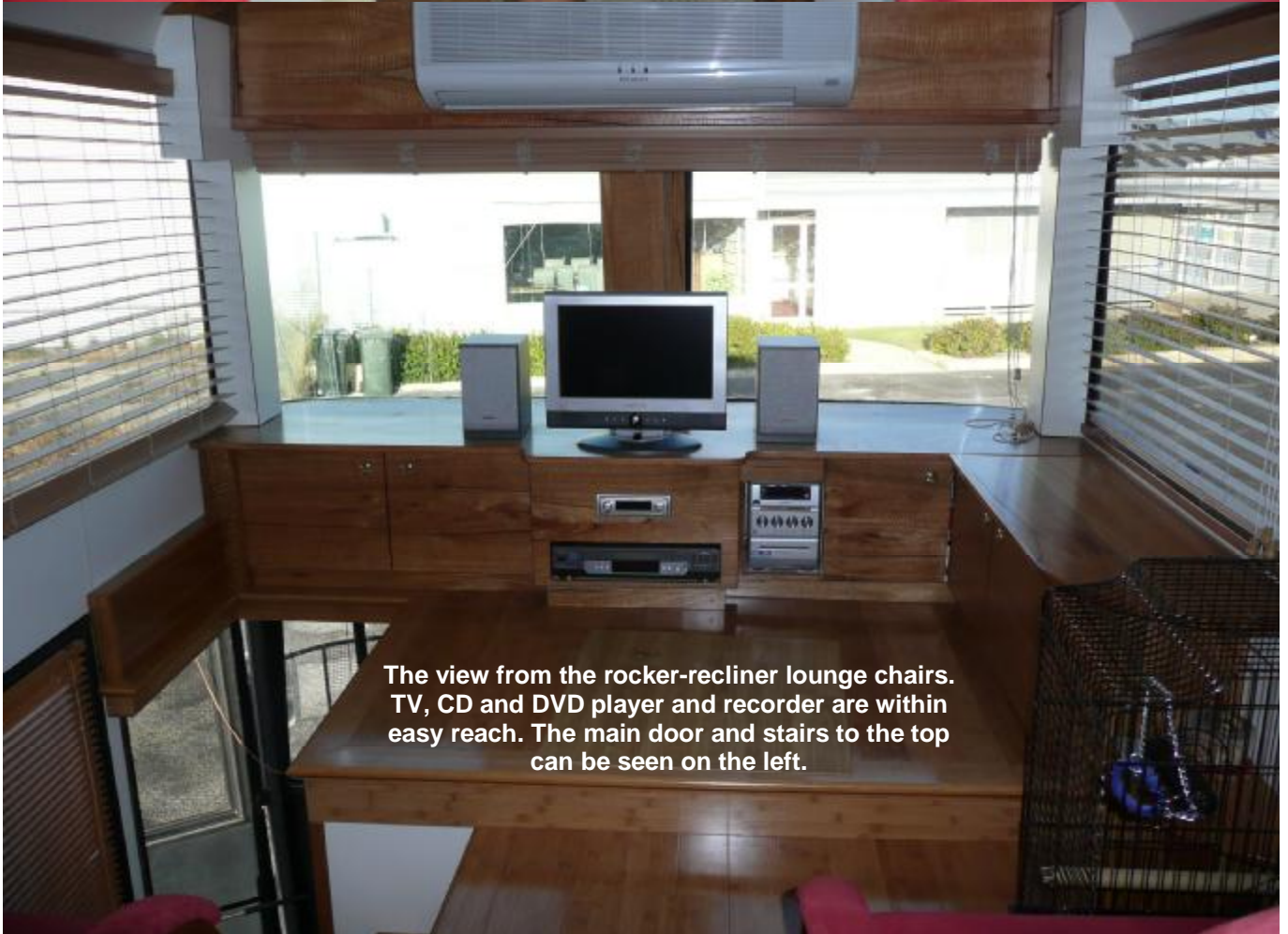
The view from the rocker-recliner lounge chairs. TV, CD and DVD player and recorder are within easy reach. The main door and stairs to the top can be seen on the left.