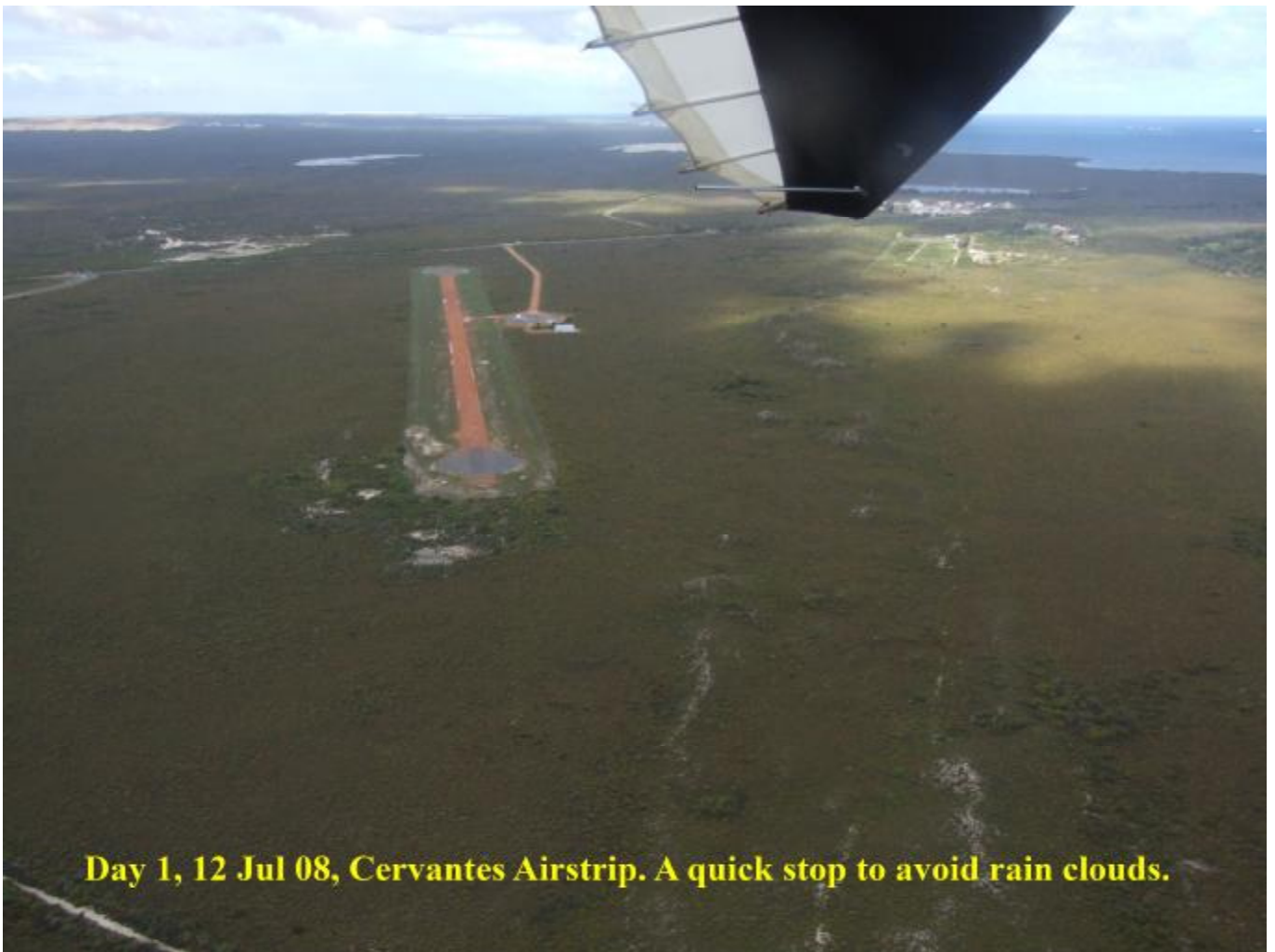
Day 1, 12 Jul 08, Cervantes Airstrip. A quick stop to avoid rain clouds.