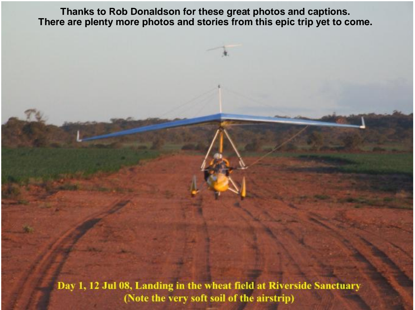
Day 1, 12 Jul 08, Landing in the wheat field at Riverside Sanctuary (Note the very soft soil of the airstrip)

Thanks to Rob Donaldson for these great photos and captions. There are plenty more photos and stories from this epic trip yet to come.