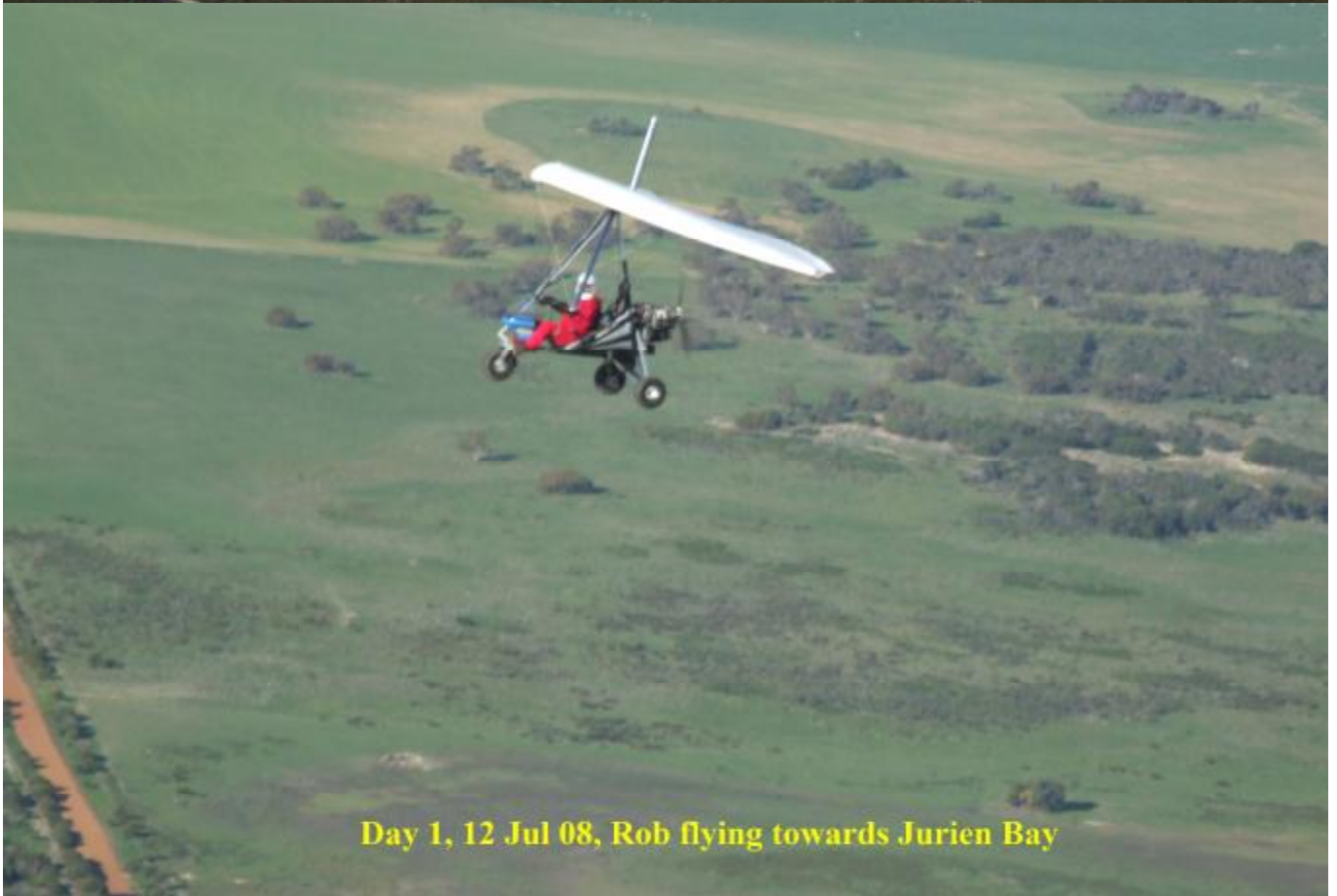
Day 1, 12 Jul 08, Rob flying towards Jurien Bay