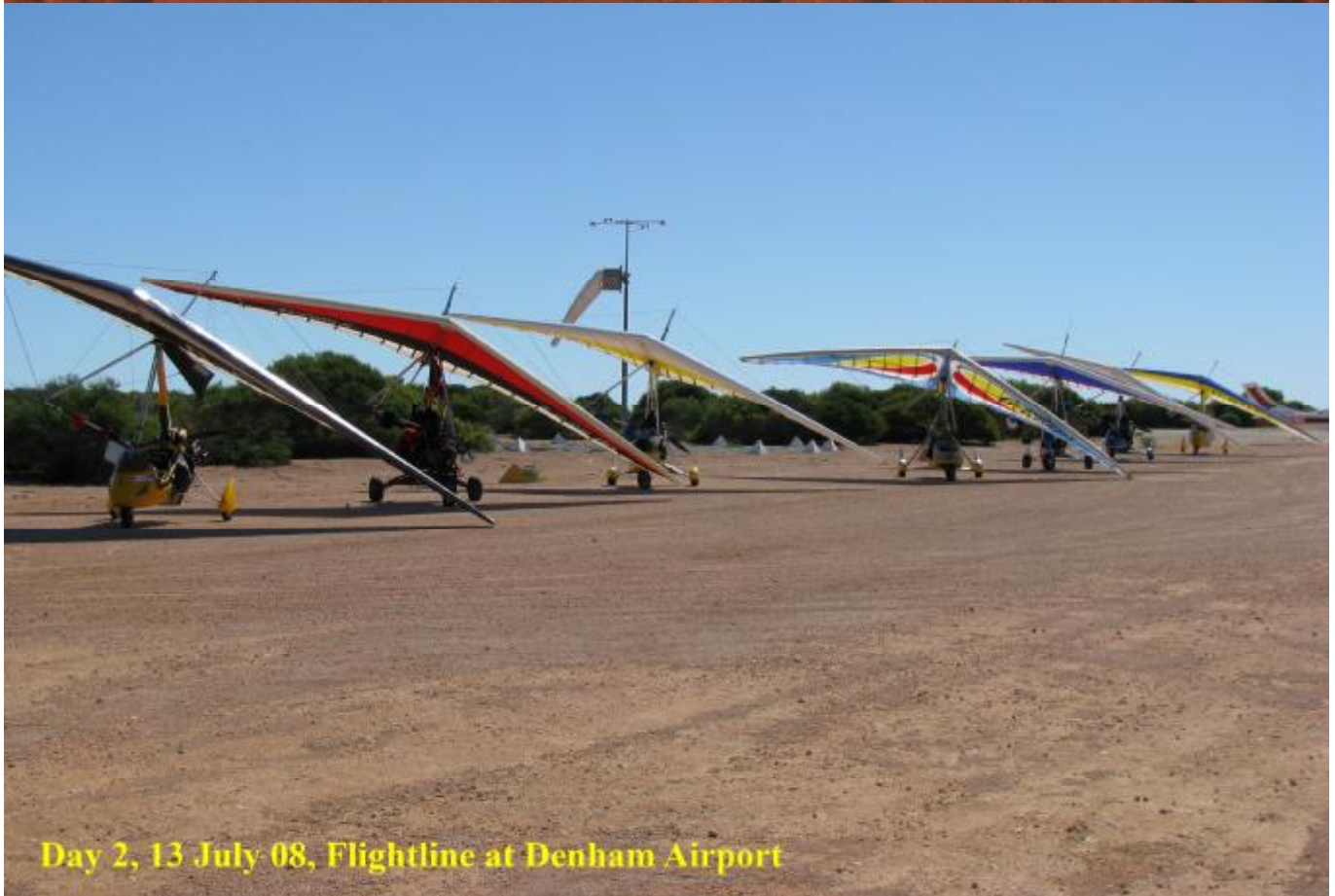
Day 2, 13 July 08, Flightline at Denham Airport