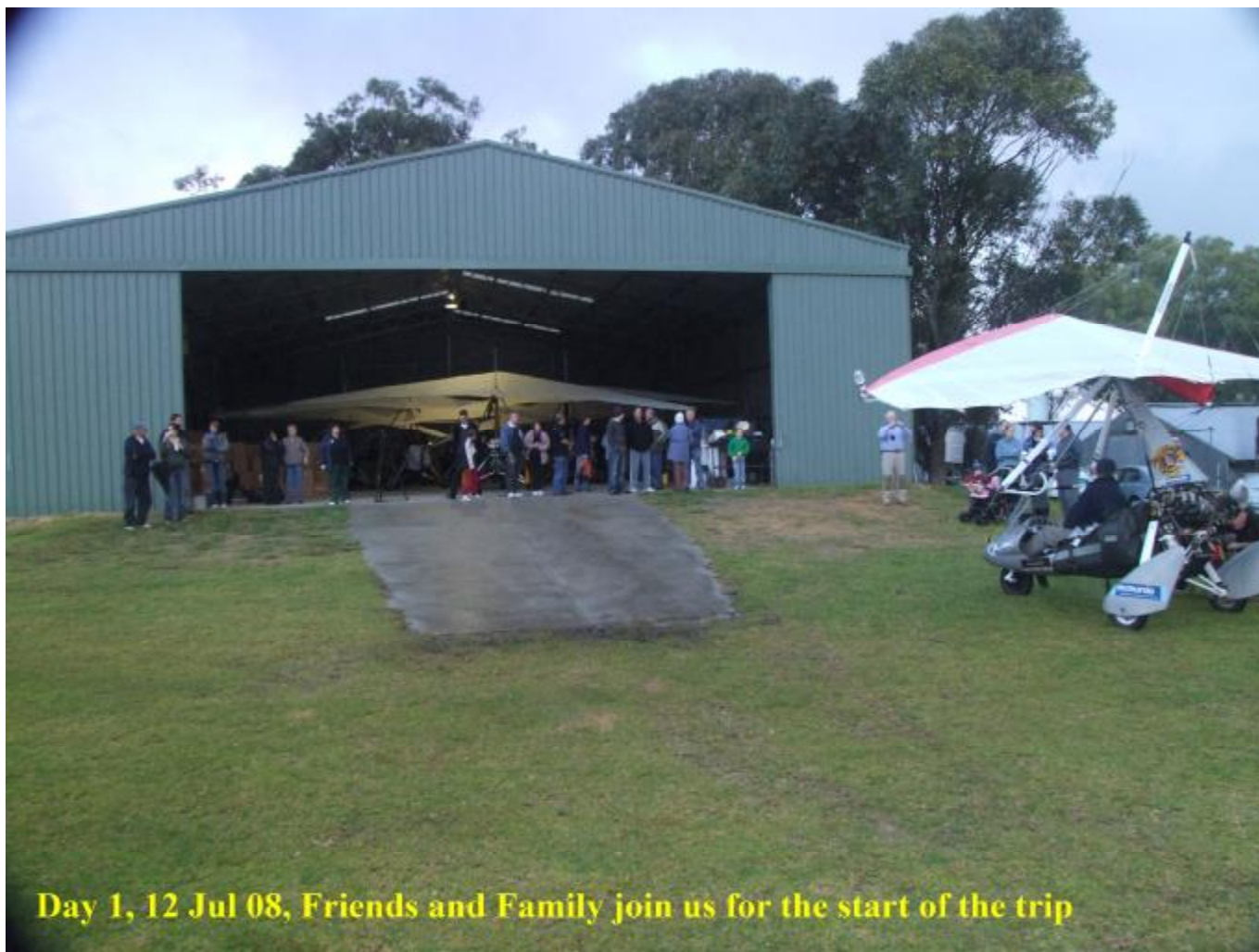
Day 1, 12 Jul 08, Friends and Family join us for the start of the trip