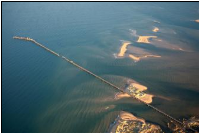
Carnarvon's famous one mile timber jetty. Sadly, it was set on fire by vandals causing $100,000 damage