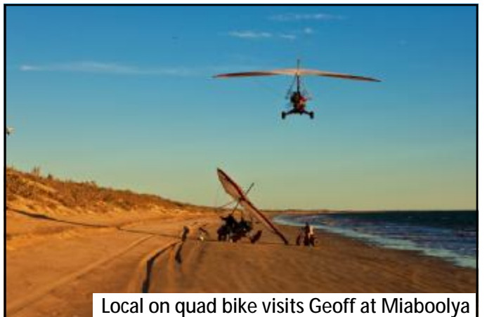
Local on quad bike visits Geoff at Miaboolya