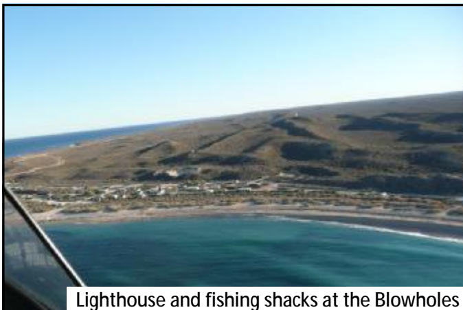
Lighthouse and fishing shacks at the Blowholes