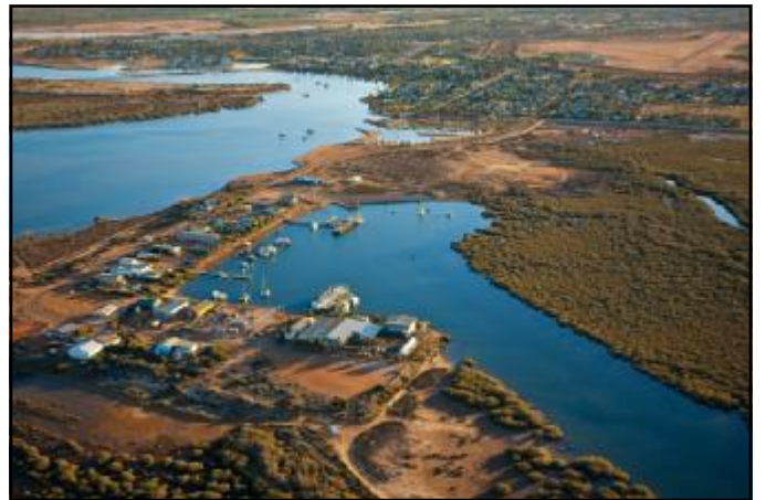
Carnarvon's fishing harbour. The facine and the town are behind with the airport in the top right corner